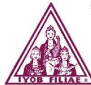
Job's Daughters International

Your are cordially invited to the 2nd Annual Masonic Youth Showcase of Southern Illinois