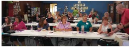
Counting Education Training for Center Staff and visitors from the Springfield Dyslexia Center.